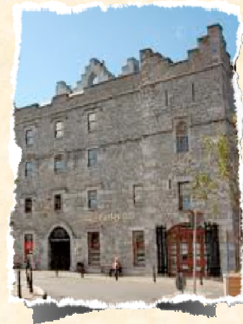
Roscommon: The second